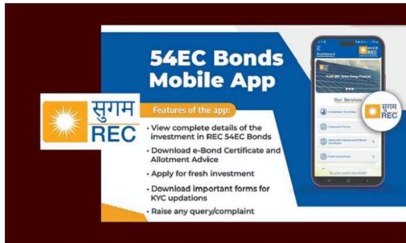
REC launches its 54EC Bonds Mobile App – 'SUGAM REC'

Gurugram, 6 th October, 2023: REC Limited is immensely proud to share that a mobile application 'SUGAM REC' has been developed exclusively for REC's 54EC Capital Gain Tax Exemption Bonds.