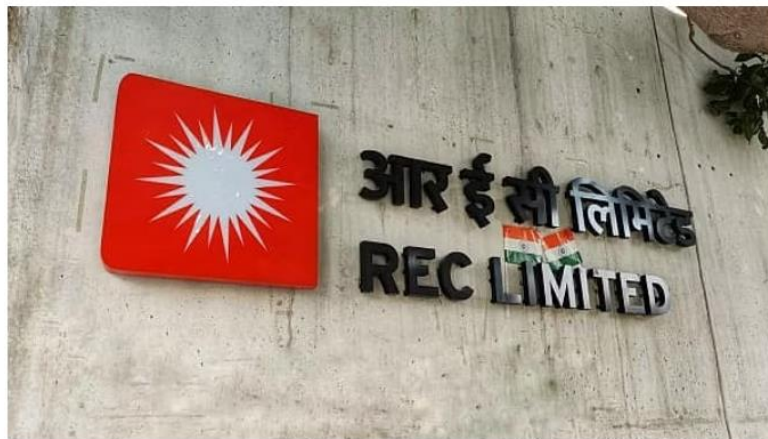
REC Limited launches app for 54EC bond investors PSU Watch Archives

The name of the mobile application is 'SUGAM REC', which will offer investors with complete details of their investments in REC 54EC bonds